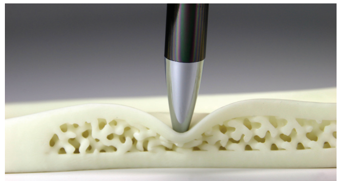
E-Shore A 80

This advanced engineering-grade material is a polyurethane-like material that produces a final material with soft Shore A values of 40 or 80 depending on your needs. E-Shore A is a material developed for end-use applications such as footwear, sporting goods, and other uses requiring durability, comfort and flexibility. E-Shore A is also waterproof.